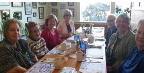
March Breakfast at Norma's