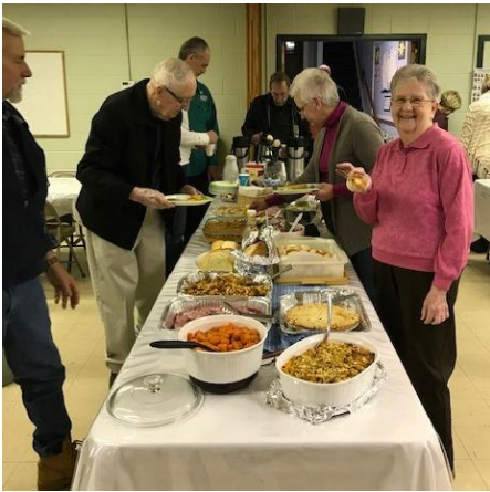
Dinner is served!